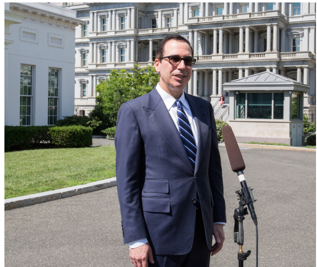
Secretary of Treasury Steve Mnuchin.

CAATSA does not, however, provide for sanctions against Putin himself. It employs an indirect, two-stage approach: first threaten a large number of Russian political and business figures with sanctions, then sanction a subset of these figures when and how the executive branch later decides. Accordingly, CAATSA required the Secretary of the Treasury, in consultation with the Director of National Intelligence and the Secretary of State, to prepare within 180 days of CAATSA’s