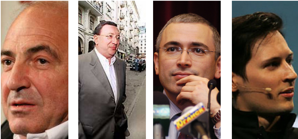
From left to right: Boris Berezovsky, Valdimir Gusinsky, Mikhail Khodorkovskiy, Pavel Durov.

company, Yukos, was absorbed by the Russian oil giant Rosneft, headed by Putin’s old friend and ally, Igor Sechin. Since then, Putin has successfully asserted his power over Russia’s other business magnates. In 2014, the owner of the oil company Bashneft, “oligarch” Vladimir Yevtushenkov, was arrested, and his legal troubles continued until he handed Bashneft over to Rosneft. The same year, Pavel Durov, founder of a Russian version of Facebook called VKontakte (“In Contact”), was similarly squeezed out of his company, which passed to Alisher Usmanov, a Kremlin-friendly metals magnate.