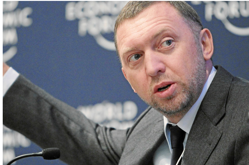
Oleg Deripaska.

On December 19, 2018, the Treasury Department, as required by CAATSA, notified Senator Mitch McConnell that it had reached a proposed agreement under the Barker Plan. Under a "Terms of Removal Agreement," Deripaska would reduce his stake in Rusal and the company would be released from sanctions by January 30, 2019, assuming Congress did not scuttle the plan after a mandatory one-month review period. As it turns out, on January 16, the Senate voted 57 to 42, which was three votes short of the 60 votes necessary to pass Senate Joint Resolution 2 disapproving of the termination of sanctions on Rusal, EN+, and another of Deripaska's companies, EuroSibEnergo, in accordance with the Treasury Department letter to McConnell outlining the Barker Plan. Notwithstanding the Senate vote, the House voted 362 to 53 the next day against the Barker Plan in a purely symbolic act of disapproval. 14 Senator Chuck Schumer then tried to convince McConnell to have the