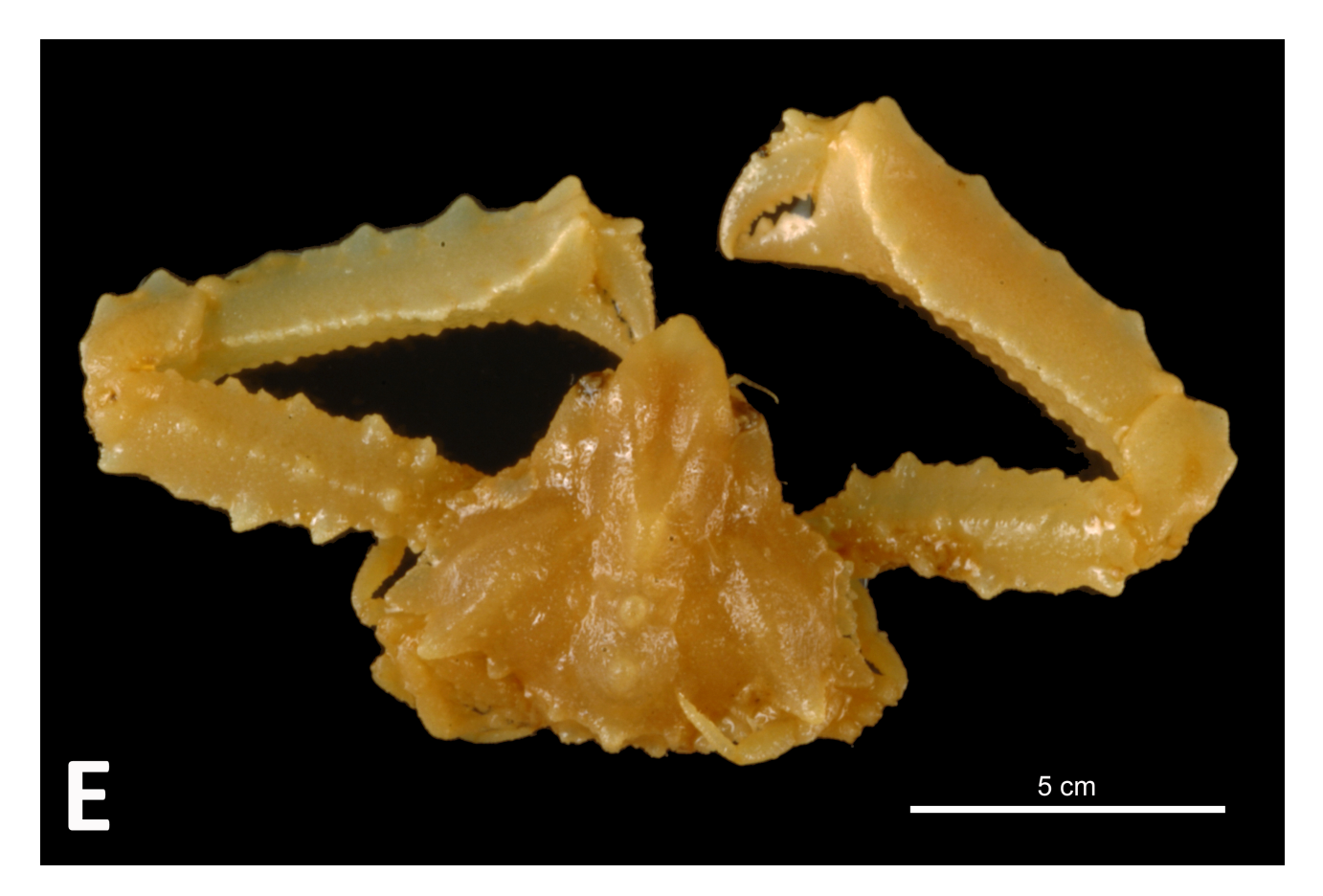
Figure 1 (continue). E , Enoplolambrus cf. carenatus , 1 male (MZUF 4290), carapace width: 16.0 mm, Sri Lanka, Trincomalee, -7-11 m, II.1889, leg. K. Fristedt.