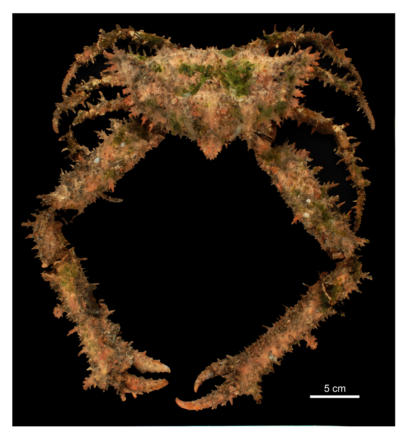
Figure 2 . Daldorfia spinosissima , 1 male (MZUF 4292), carapace width: 200.0 mm, Mauritius Is., IV.1875, purchased by L. De Greaux.