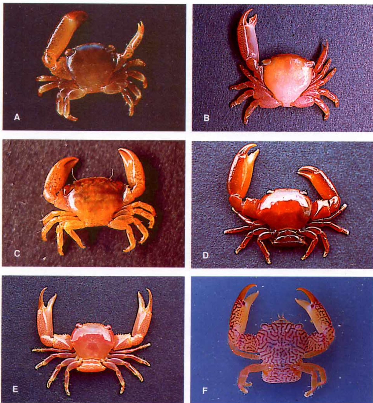
PL. 1. — A. Tetralia cinctipes Paulson, 1875. Live ♂, Tuamotu Archipelago, French Polynesia (MNHN-B 25326). B. Tetraloides heterodactyla (Heller, 1861). Live ♂, Tuamotu Archipelago, French Polynesia (MNHN-B 25325). C. Trapezia areolata Dana, 1852. Live ♀, Tuamotu Archipelago, French Polynesia (MNHN-B 25313). D. Trapezia globosa sp. nov. Live ♀ infected with bopyrid parasite, Marquesas Islands, French Polynesia (MHNN-B 25321). E. Trapezia punctimanus Odinetz, 1984. Live, Tuamotu Archipelago, French Polynesia (MNHN-B 22994). F. Trapezia speciosa Dana, 1852. Live ♀, Tuamotu Archipelago, French Polynesia (MNHN-B 25319).