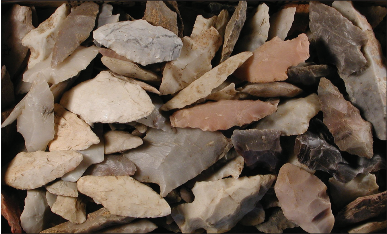
Indians chipped dart points from novaculite.