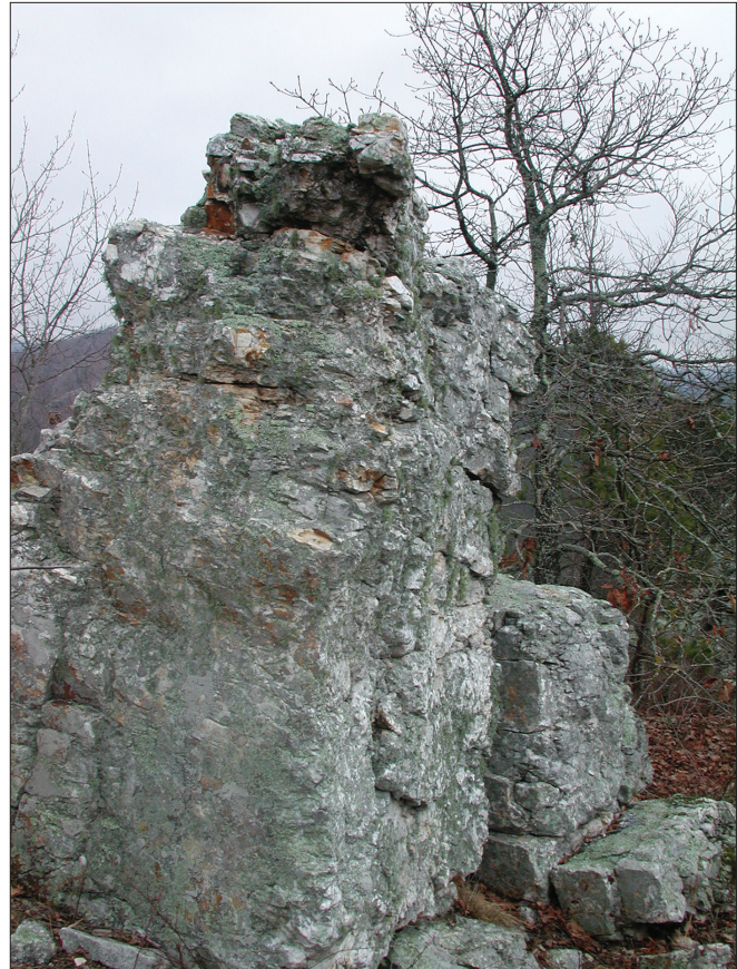
Above: Indians battered outcrops, dug pits, and mined trenches to reach useable stone at quarry sites.