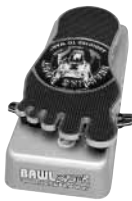
BAWL BUSTER™ WAH