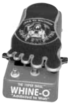
SUPER BAWL™ WHINE-O WAH