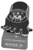
WHINE-O™ WAH PLUS

Try our entire line of snarling wah pedals and stomp boxes: